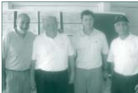
2nd Place: Abate-Monroe-Atkinson-Brindisi